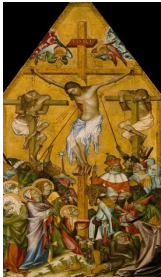
The Crucifixion of Christ (Kaufmann Crucifixion), c.a., 1340

When we discussed the idea for a special issue of the JCRT focusing on The Monstrosity of Christ: Paradox or Dialectic?, we made the decision not to over invest in the “review format.” Rather, we thought that these pieces primarily should work as “engagements” – short essays that would prompt a conversation that would, hopefully, carry our ideas beyond the immediacy of the special issue. For my part, I thought it was important to engage the questions, “what does Christ demonstrate” (WDCD?) about materiality and in what ways could a reconfigured demonstration of Christ’s materiality (the materiality of materiality) lead to new and different concepts of Christian theology? So, in the spirit of that early decision, “this is not a review.”